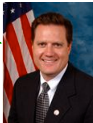
Mike Turner Congressman